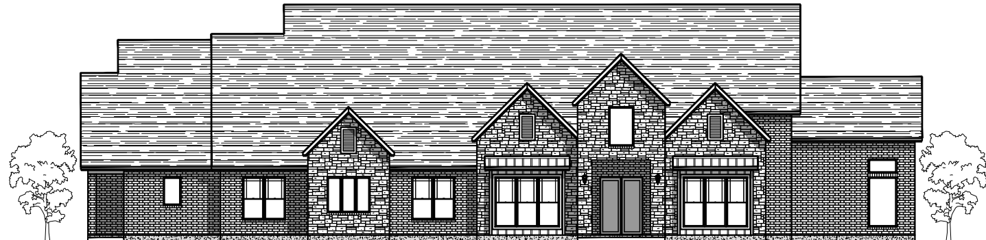
02 2ND FLOOR REFERENCE: NONE SCALE: NOT TO SCALE